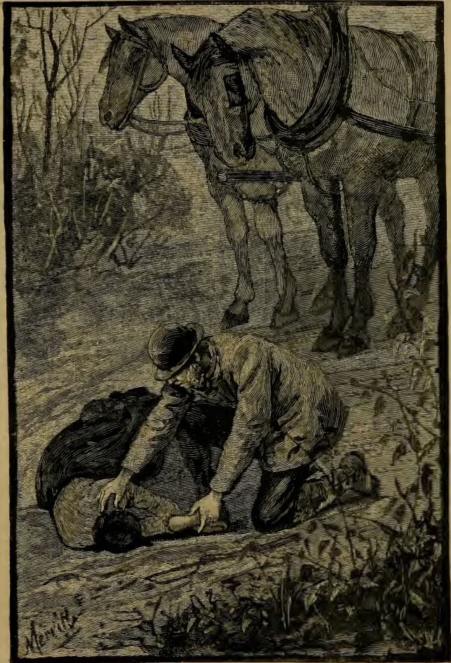
"A wagoner had found her in a ditch." - Page 115.